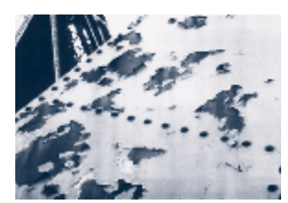
There is a problem with corrosion on the unrestored part of the bridge and the paint is in poor condition.